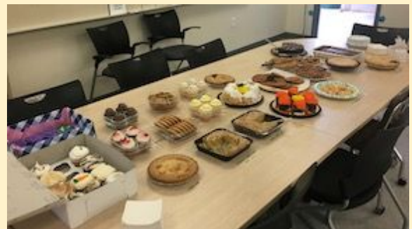
Sweet Tooth Friday

Thank you, once again, to all our wonderful volunteers! All of your time, delicious food, and donations were greatly appreciated! We loved seeing the teachers' and staff's happy faces, and they clearly enjoyed a fabulous week. :) Thank you so much!