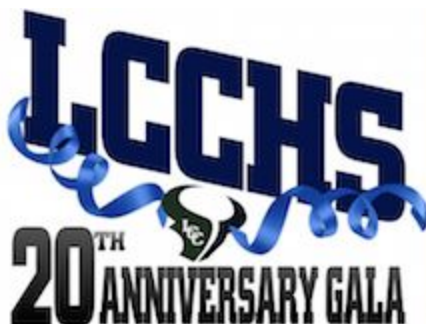
Click to buy tickets